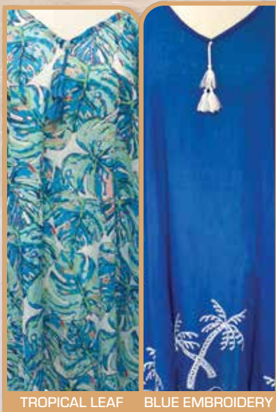
TROPICAL LEAF BLUE EMBROIDERY

Maggie Style #10015 S - XL | $18.50 Fabric: Woven Rayon 4 piece per pattern minimum Scale: 1 • 1 • 1 • 1